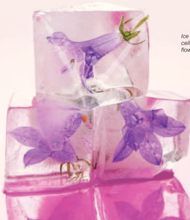
Ice Age cosmetics based on stem cells from extremophile Alpine flowers which survived the Ice Age